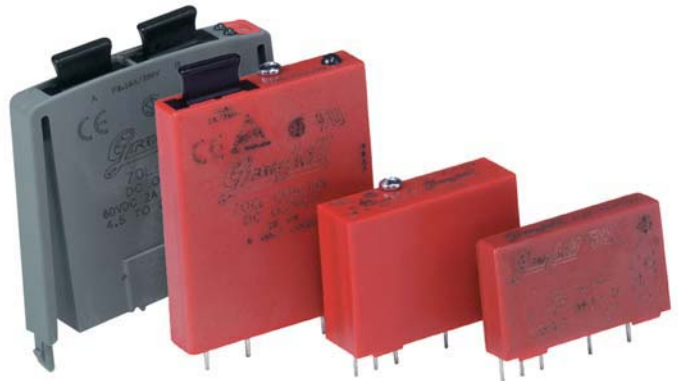
70L-ODC5R 70G-ODCR/OACRLY 70-ODCR/OACRLY 70M-ODCR