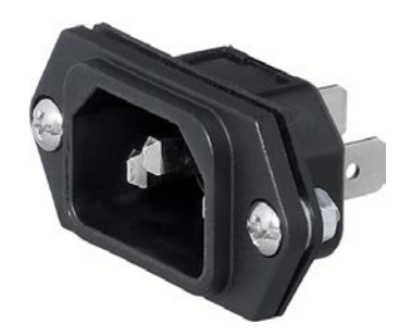
6100 with sealing to appliance