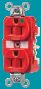
HBL® Extra Heavy-Duty