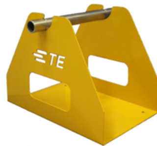
Universal reel holder